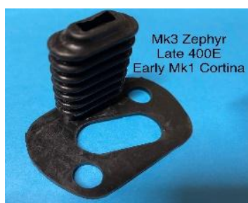
+ Mk1 Cortina