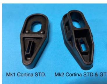
Mk1 Late + Mk2 Cortina GT