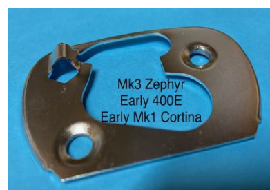
+ Mk1 Cortina