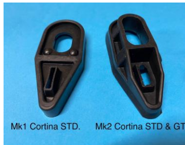
Mk1 Late + Mk2 Cortina GT