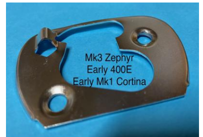
+ Mk1 Cortina