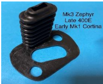
+ Mk1 Cortina